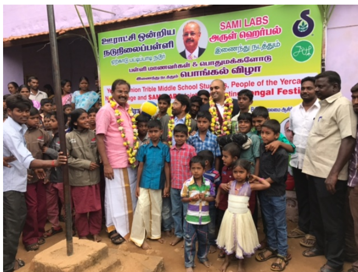
Celebrating the Pongal festival.

By WholeFoods Magazine Staff - March 28, 2017